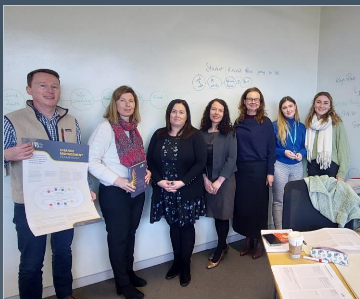
Facilitation skills workshop held during PD week