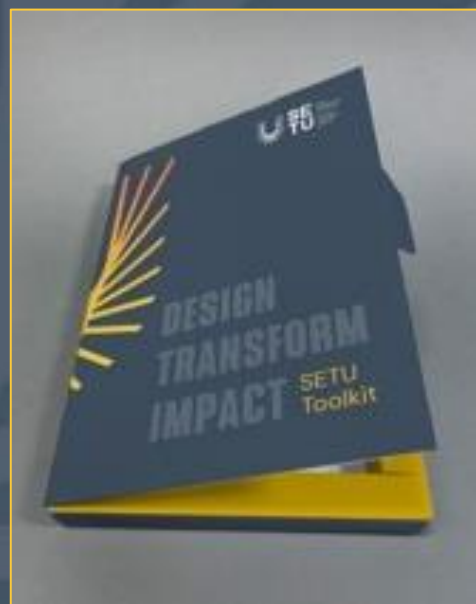
SETU Change Management Toolkit

For those who wish to get more involved we will shortly host a series of in-person sessions with our Senior Change Management Professional for training in workshop skills and change management techniques along with toolkit talks, think tanks or simply 'get togethers'. We encourage our staff to join the Change Network to keep informed and to be engaged in our change and transformation initiatives by emailing change@setu.ie .