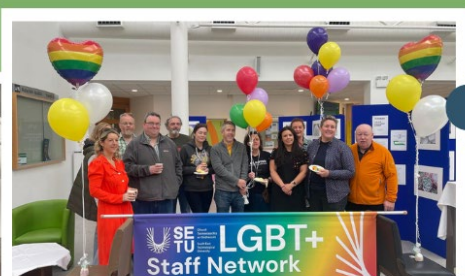
Pride Coffee Morning