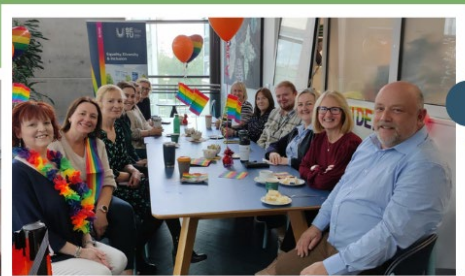
Pride Coffee Morning