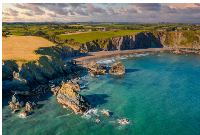
Copper Coast, Co. Waterford.