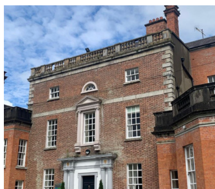
Clermont House, SETU Wicklow