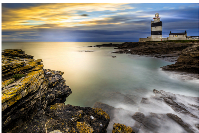
Hook Head, Co. Wexford.

International Postdoctoral Fellows can find more information here: SETU | International Supports and EURAXESS . With regards to Irish taxation, Postdoctoral Fellowships are generally regarded as being distinct from a scholarship. In such cases, the scholarship exemption does not apply, and income derived from the fellowship is taxable and subject to deductions (Income Tax, USC, and PRSI as applicable). Further information on Irish taxation can be found on the website of the Office of Revenue Commissioners. Accommodation may be found on one of these two sites: www.daft.ie/rent or https://setustudentpad.ie/Accommodation