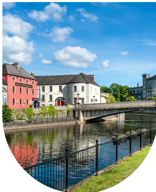
Kilkenny City, Co. Kilkenny.

For international applicants, conducting a Postdoctoral Fellowship in a new country is an exciting experience and need not be daunting. Ireland, also known as The Emerald Isle, is a vibrant European nation known for its breathtaking landscapes and warm-hearted residents. Being the only native English-speaking country in the European Union (EU), it offers a welcoming and familiar environment for many international visitors.