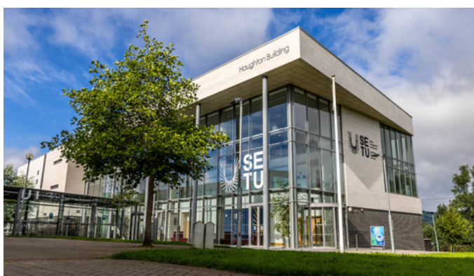
Kilkenny Road Campus, SETU Carlow